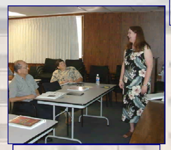
Feb. 9: HED prepares for the launch of P2 with a three-day "P2 Boot Camp--A Manager and Executive Overview". This new state-of-the-art information management system replaces PROMIS and allows USACE employees to use one automated tool, eliminating redundant systems.