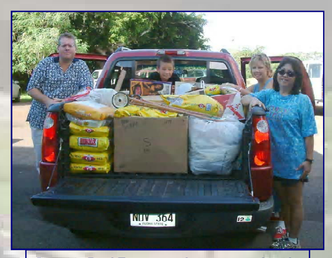
Dec. 22: Real Estate employees spearhead a food drive to feed the island's homeless. HED and POD employees donated hundreds of pounds of nonperishable food items.