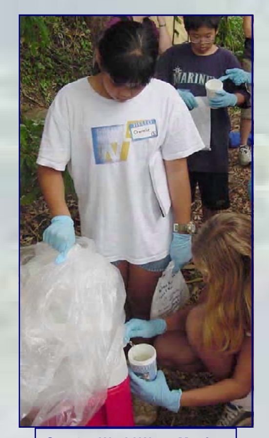
Oct: 17: World Water Monitoring Day gives Washington Middle School students the chance to learn about water sampling, data collection tools and the relationship between upstream activities and the ocean. Experts from HED along with various government agencies helped the 7th and 8th graders collect samples at Makiki Stream as part of the event.