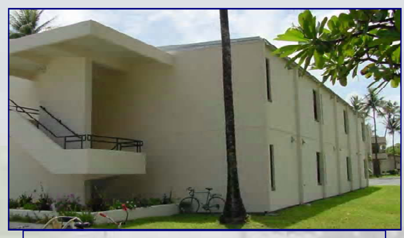
Feb. 7: Single military members move into the newly renovated bachelor quarters in Kwajalein. The $1.8 million project improves the quality of life for Soldiers.