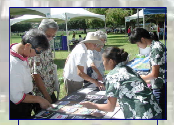
April 24: Volunteers from HED and other agencies celebrate Earth Day at Kapi'olani Park. Festivities began with a scavenger hunt, displays, live entertainment, trolley tours of the Ala Wai watershed, alien algae removal, catfish round-up and picnics.