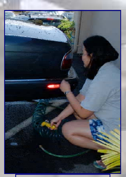
Aug. 2: The Ho'okupu Ohana, HED's Booster Club, raises over $900 in proceeds from a silent auction of over 80 items including a special car wash. The Ho'okupu Ohana provides a wide range morale-boosting activities for HED employees.

Radford High School teachers try out their new computer lab. Radford received the new lab as part of the ongoing "DoD in the Schools" program.