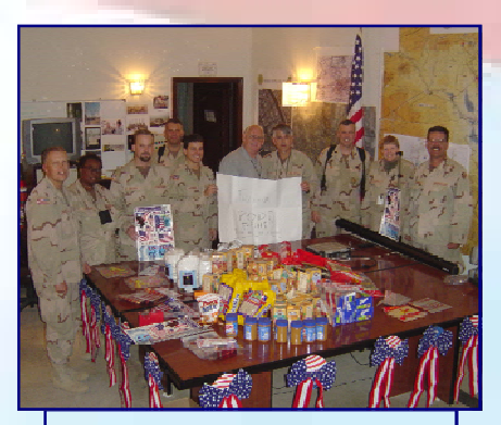
USACE members serving in Iraq receive a bit of Aloha from HED/ POD employees.

Thanks to all who volunteered their time and talents to help build a foundation for democracy and stability. USACE Gulf Region Division (GRD) and the Afghanistan Engineer District (AED) are helping the war on terrorism by providing engineer and technical support, providing temporary base camps for over 100,000 Soldiers as well as repairing the damaged infrastructures, providing educational assistance and destroying captured enemy ammunition.