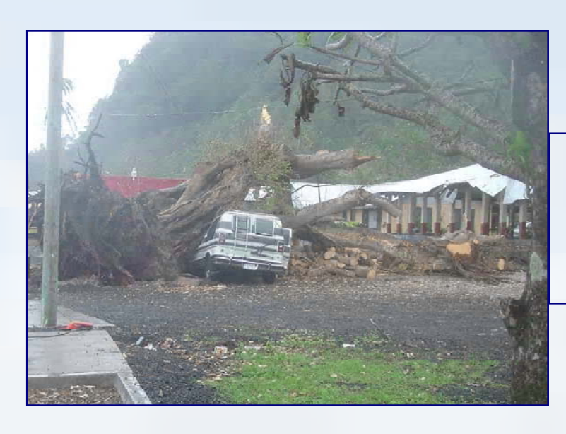
Jan. 5: Super Typhoon Heta hits American Samoa with winds of 184 MPH. HED's EMD sends a team to assist FEMA and assess damage to the Poloa Shore Protection Project built by HED.