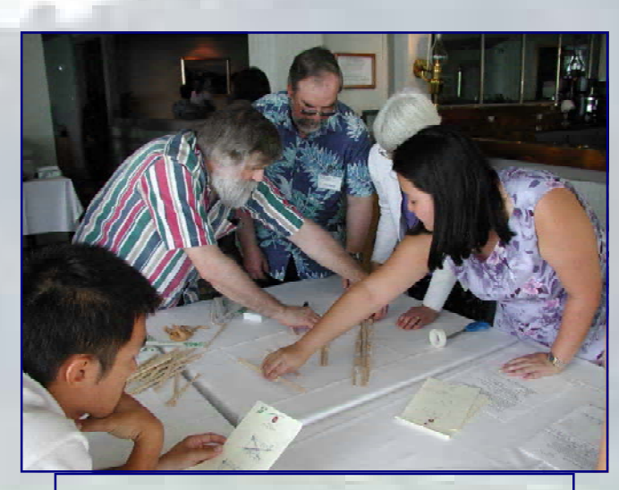
Nov. 3-7: The 4th Annual POD Civil Works Summit, held at Sheraton Moana Surf Hotel, offers employees from HED, HQUSACE, Assistant Secretary of the Army for Civil Works, Alaska District and POD a chance to share ideas, information and problems as well as practice their team working skills.