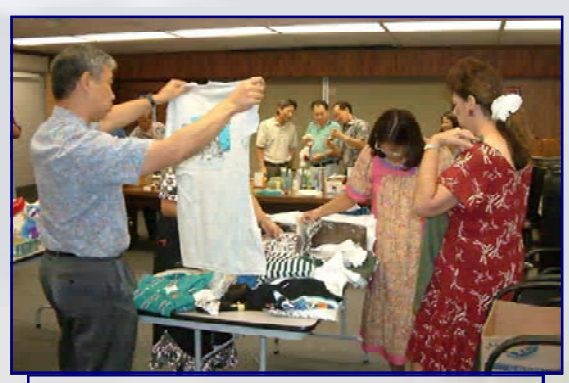
Feb. 6: Design Branch hosts its annual garage sale to raise money for various morale-building events.