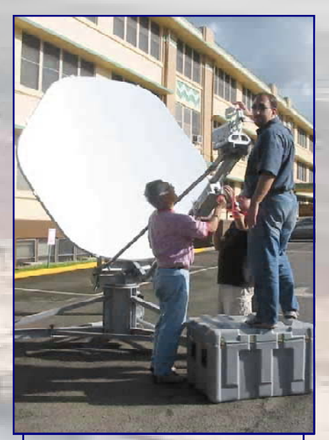
July 12-13: CTOC-2 Training. USACE's CTOC -2 plays a vital role in communication during natural disasters and other emergency situations.