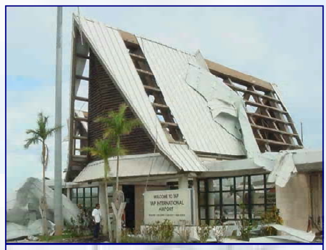
April 12: Typhoon Sudal hits Guam and Yap in Micronesia. USACE deploys 20 members and the Containerized Tactical Operations Center (CTOC-2) with satellite communications equipment which is crucial to FEMA's operations. USACE also assisted with GIS mapping, generator assessment/installation, technical assistance and development of the debris management plan for Yap.