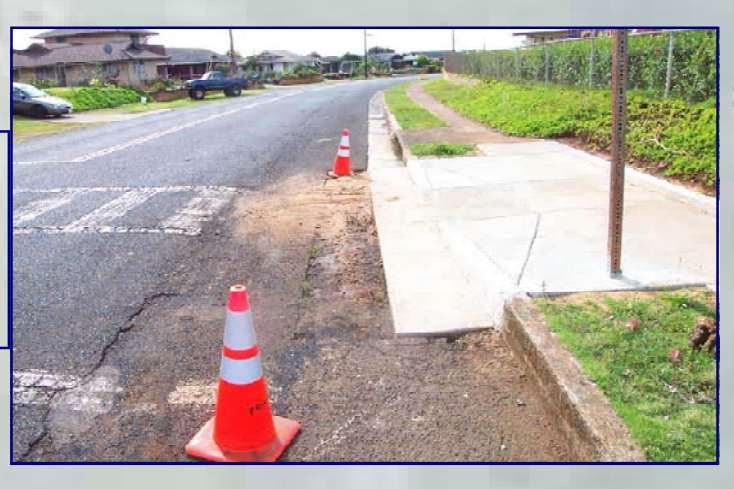
Nov. 18: HED executes a support agreement for $4.4 million in design funds to assist the State of Hawaii Department of Transportation in implementing ADA ramps in various state-wide locations.