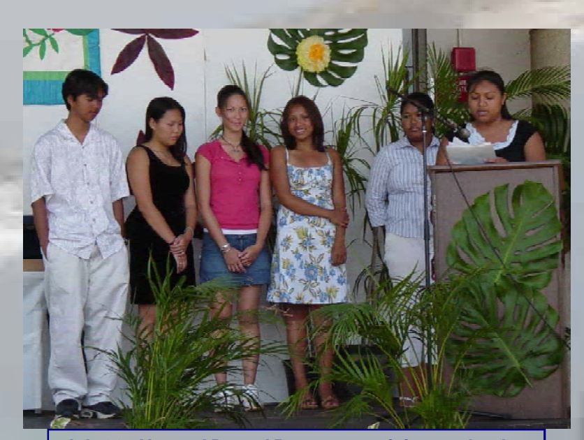
July 23: Upward Bound Program participants thank HED members for serving as mentors.