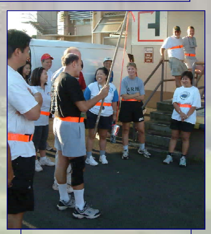
May 18: The Safety and Occupational Health Office kicks off the 10th Annual Safety Day with a fun walk/run.