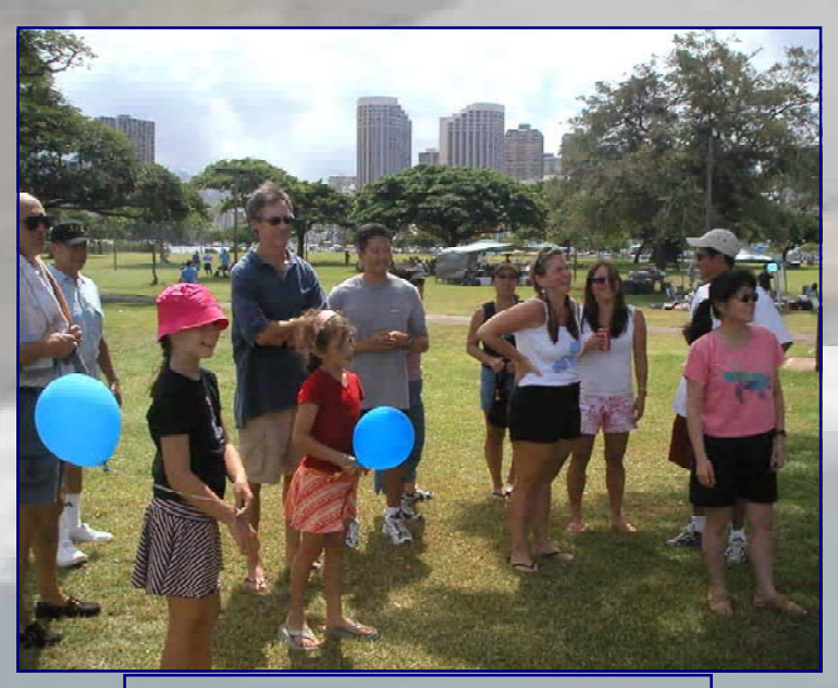
June 25: HED employees gather for Org. Day at Ala Moana Park in Waikiki.