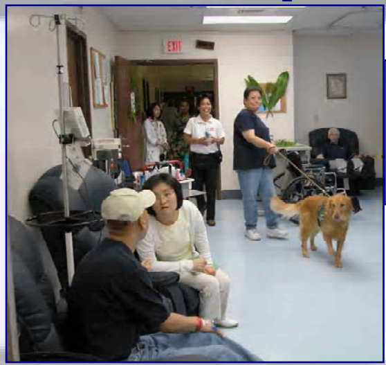
Sept. 9: Grand opening of Tripler Army Medical Center's (TAMC) new Chemotherapy Treatment Center. Contractors and staff from HED were instrumental in the improvements which provide Military members and their families better medical care.