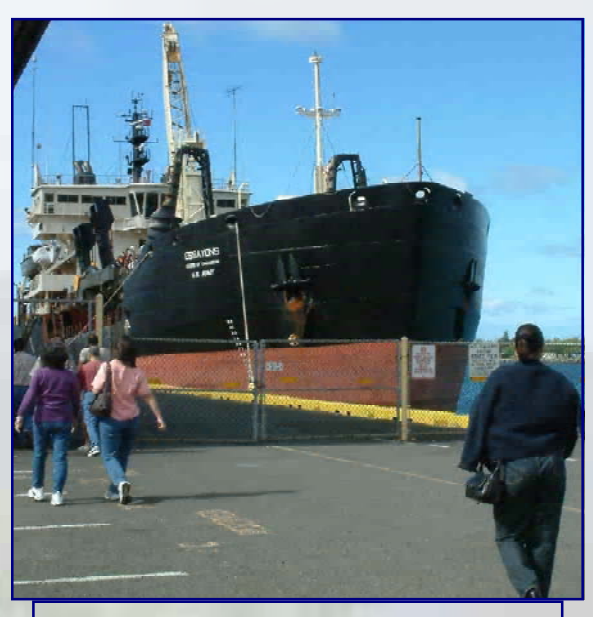
March 2: HED's Civil Works Technical Branch coordinates the dredging of Honolulu Harbor with the U.S. Navy and Hawaii Dept. of Transportation. HED and POD employees are treated to a tour of Portland District's dredge Essayons.

■ March 31: HED's Resource Management Office develops SOPs that cover regionalization of: the Army suggestion program, mission organization, supervision and administration reporting and direct funds - funding authorization document processing.